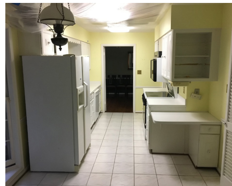
Red Clover galley kitchen before renovation

Property Summary- Model Name: The General Above grade square feet: 2,240 Year built: 1969 Elementary School: Hunters Woods