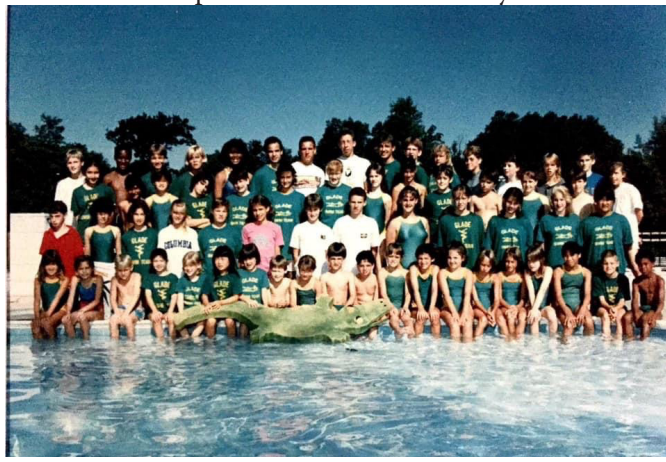
Glade Gators, circa 1985