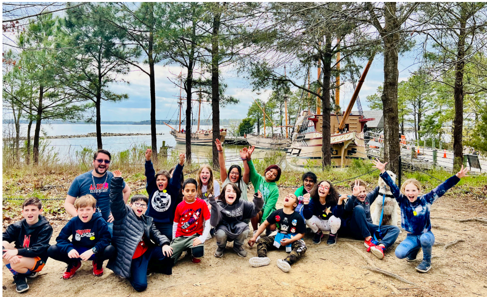
Aldrin Elementary 4th graders in front of the ships at Jamestown. The class took a field trip to Jamestown and Williamsburg, and even brought Aldrin's service dog.