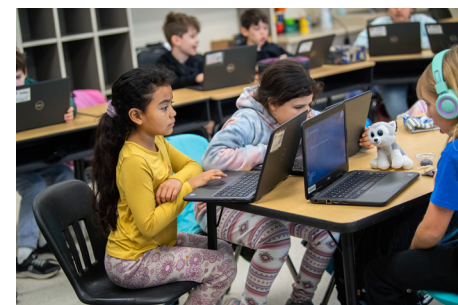
Rigor, Relationships, & Respect is the Lake Anne Way! Students at Lake Anne Elementary hard at work