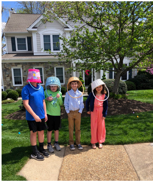
Easter egg hunts are just one of the traditions at Wescott Woods.