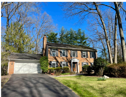
Red Clover Court exterior