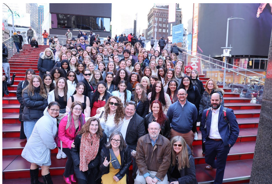
Herndon Choir and Drama students and chaperones explored New York City the end of March.

Performances at Herndon High School, April 21st at 7:00 p.m. April 22nd at 2:00 p.m. and 7:00 p.m. April 23rd at 2:00 p.m.