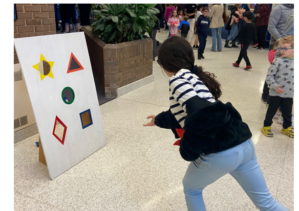
Armstrong Elementary’s PTA held Family Fun Night on Friday, March 24. The Family’s had a great night enjoying the moon bounce, game truck, prize wheel and bingo.