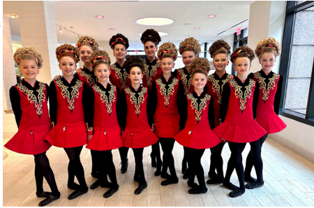
Foley Academy Girls Ceili Team

Following much success at the most recent Regional and National Championships, 14 Irish Dancers from Foley Academy in Reston will attend the An Coimisiun le Rinci Gaelacha (CLRG) World Championships, which runs April 2 – 9 in Montreal, Canada. They will represent Foley Academy and the Southern Region USA in two Ceili Team events (U13 Girls 8-Hand and U16 Girls 8-Hand), and one of the dancers will compete as a soloist in the Boys U13 Championship.