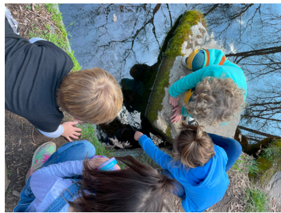
Students from Hunters Woods Cooperative Preschool love to take a walk to Walker Nature Center on a sunny day to check to see if the tadpoles in the pond are getting closer to being frogs.