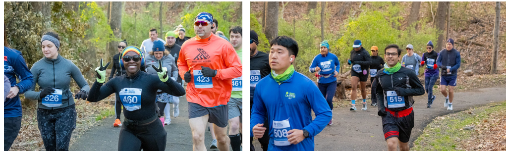
Happy, on-course runners take on the Reston paths.