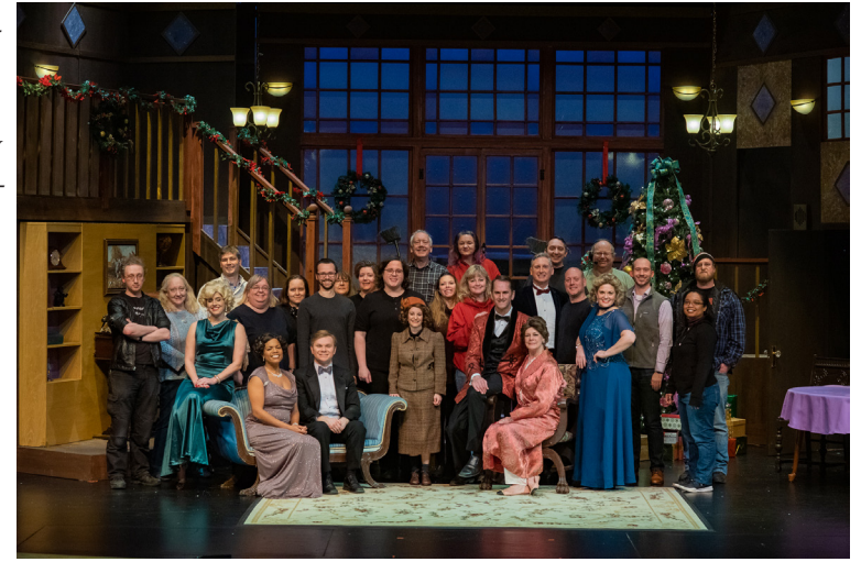
Games Afoot-- Best Play Nominee/Full Production Team