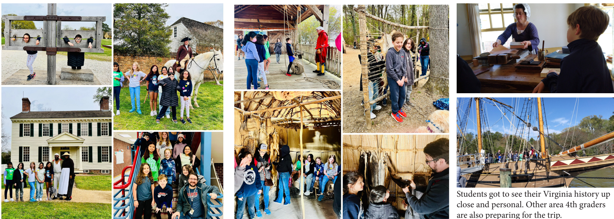
Students got to see their Virginia history up close and personal. Other area 4th graders are also preparing for the trip.