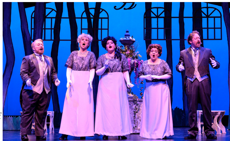
Reston Players Quintet

co-choreographing the classic Kander and Ebb musical. "We had 63 people audition for 16 roles; the level of talent was inspiring! The show itself was first performed in the 1960s, and has gone through several iterations since then. Our production will be based on the 1998 Broadway revival."