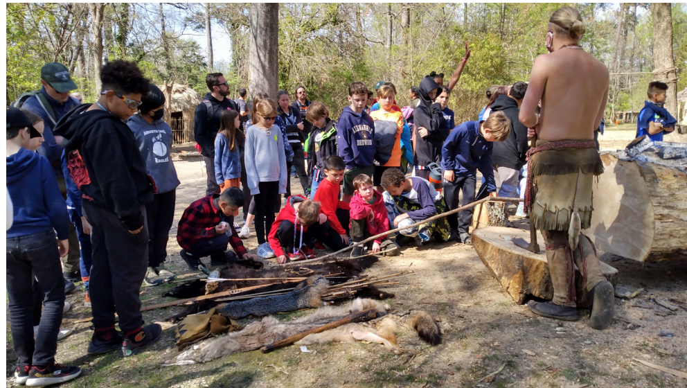
Armstrong Elementary 4th graders watch as a Powhatan reenactor shows the students how they burned canoes out of logs, and the kids touch pelts much like what they would have brought back from hunting trips.