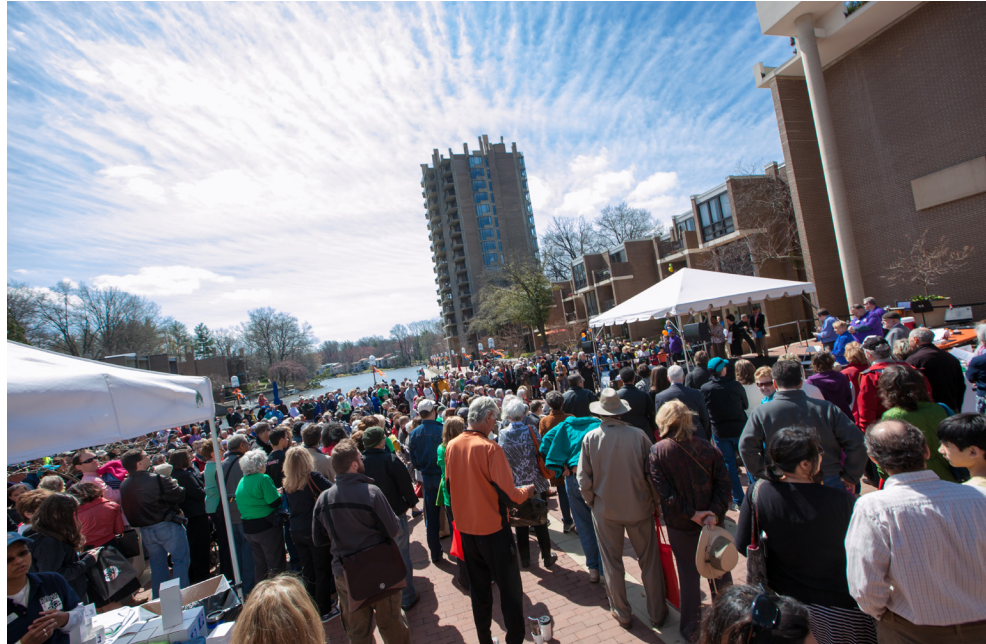
Founder's Day on April 15 will have activities for everyone in the community.

The day will kick off with a community volunteer effort, organized by Volunteer Reston. From 10 to 11:45 a.m. volunteers will clean-up the area, making sure that it shines for the events later in the day. Advanced registration to volunteer is required. If you are interested in being part of the team, go to Reston.org/AboutRA/VolunteerReston and scroll down to Adult or Minor volunteer applications. Fill the application out online, selecting Founders Day 2023 Community Cleanup as your preferred site location.