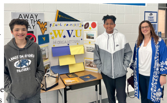
AVID photos courtesy of Melanie Meren

Teachers use AVID tools to enhance learning and connect more authentically with their students, leveraging students' backgrounds and experiences to master content in a personal way. AVID students outperform national averages in key success measures, learning to think critically and collaborate, and have higher graduation and college enrollment rates, according to a UCLA study.