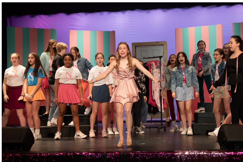
Herndon Middle School Theatre performed Legally Blonde Jr. in March.

Langston Hughes Middle School is getting set to present Frozen Jr. this month. Show times April 27, 28-- 7:00 April 29-- 3:00 p.m. & 7:00 p.m.