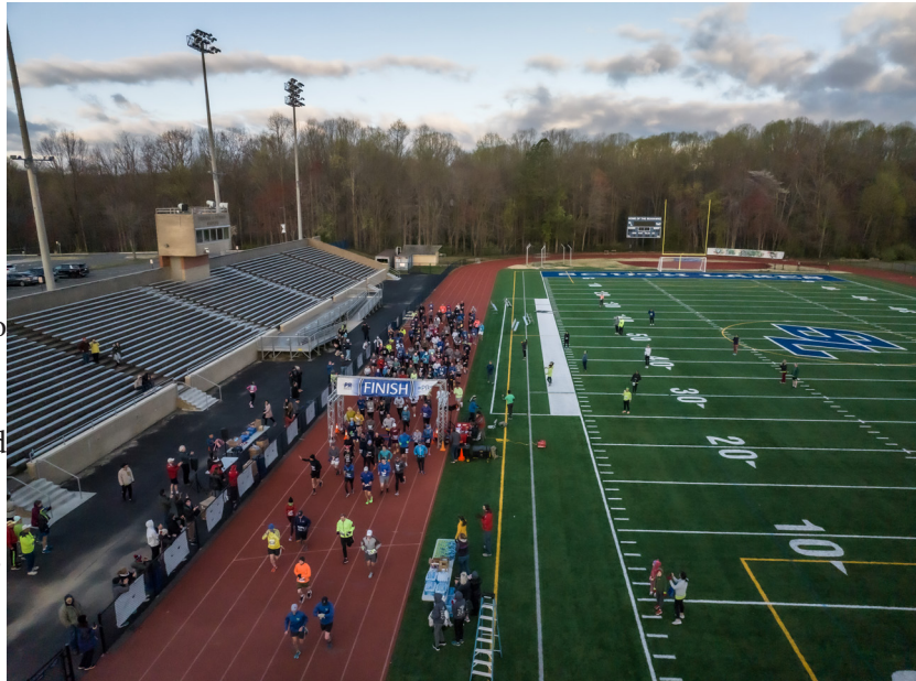
Reston Runners began at South Lakes High School track

generous donations from top tier sponsors, Stride, Reston Wealth Management, and Acorn Financial Services, allowed them to donate $5,000 in scholarships to Herndon and South Lakes High School student athletes and athletic departments via the Reston Runners Community Fund.