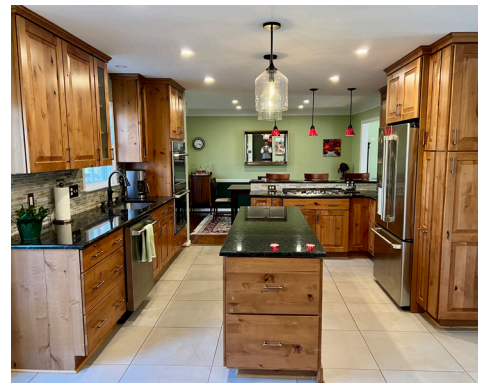
Red Clover galley kitchen after renovation