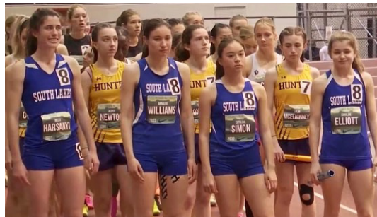
South Lakes Nationals qualifiers