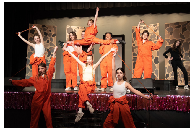
HMS performers in Legally Blonde Jr.