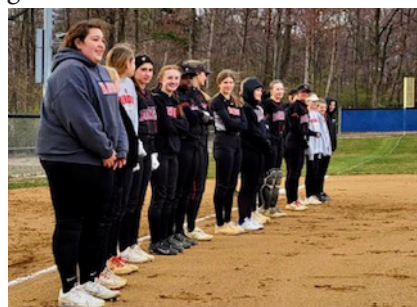
Hornets and Seahawks softball teams faced each other a cold opening night.